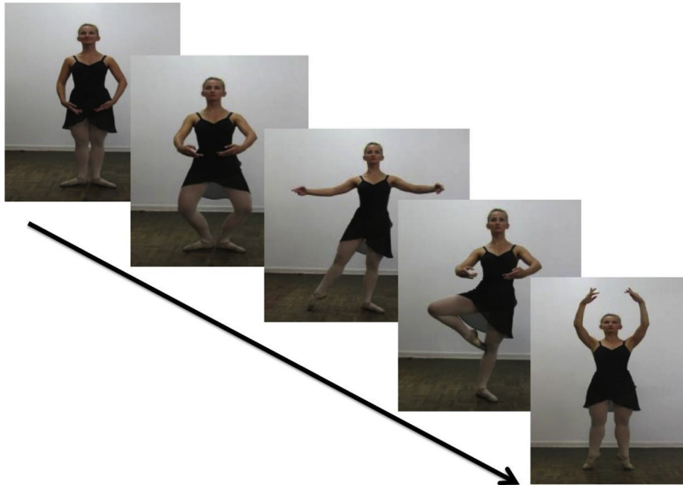
Fig. 1. Sequence of 5 ballet positions to be learned.